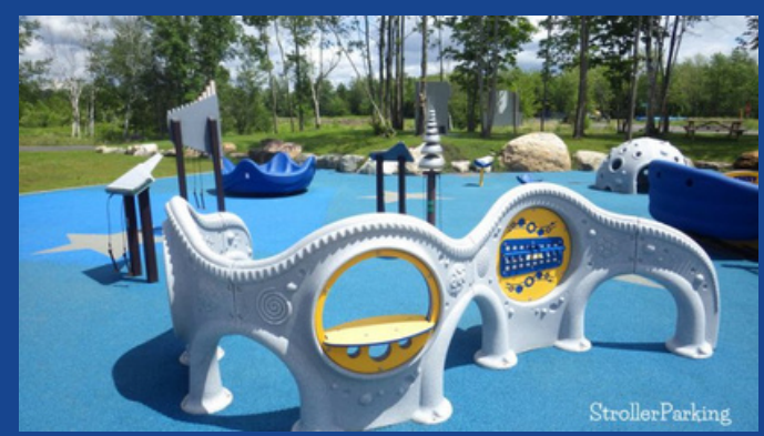
Concept photo of the all-inclusive park presented to city council.

Is your Rotary Club interested in participating in a Global Grant? You can join us for as little as $1,000. We will not seek payment of funds until we are successful in obtaining the grant. If you would like more information, have questions, or your Rotary Club is willing to commit, please email me at <u>rsawczyn@finemarkbank.com</u> or call me at 813-956-1468.